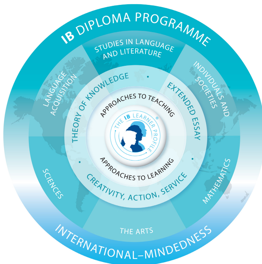
Figure 1 Diploma Programme model

The course is presented as six academic areas enclosing a central core (see figure 1). It encourages the concurrent study of a broad range of academic areas. Students study two modern languages (or a modern language and a classical language), a humanities or social science subject, an experimental science, mathematics and one of the creative arts. It is this comprehensive range of subjects that makes the Diploma Programme a demanding course of study designed to prepare students effectively for university entrance. In each of the academic areas students have flexibility in making their choices, which means they can choose subjects that particularly interest them and that they may wish to study further at university.